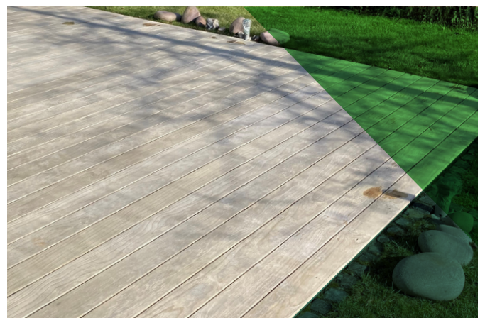
Decking in Germany after 10 years of greying and regular cleaning

It is possible to use a patio cleaning device for Accoya decks. Please refer to your decking dealer for advice. We recommend using a device with twin brush. When using close to a pool, please ensure the cleaning water is not drained into the pool.